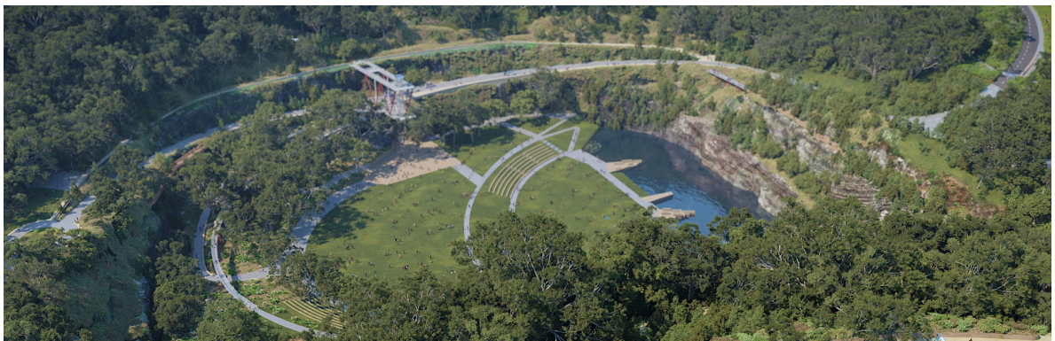
Hornsby Quarry Park, NSW

While we've won many awards over the years, we avoid rhetoric and search for the evidence which demonstrates that our work will endure. As importantly, we revisit and critique our projects to learn what refinements we can bring to the next project.