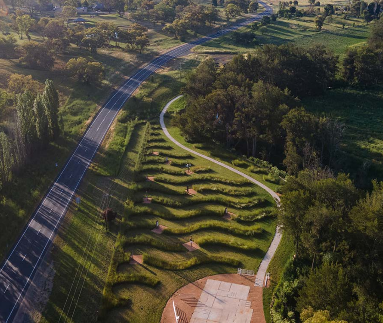
Fairbridge Farm, NSW